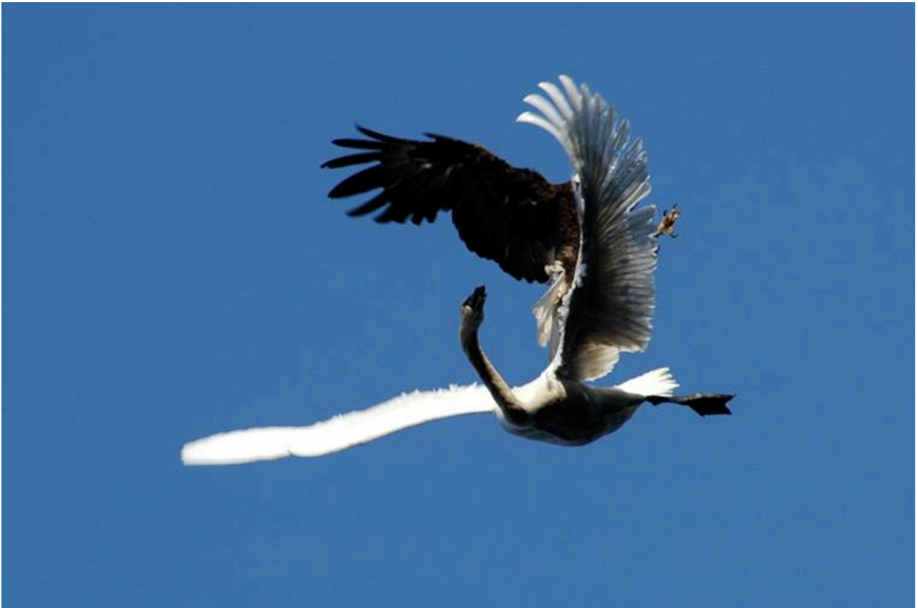
The eagle is losing his grip on the swan in this picture.