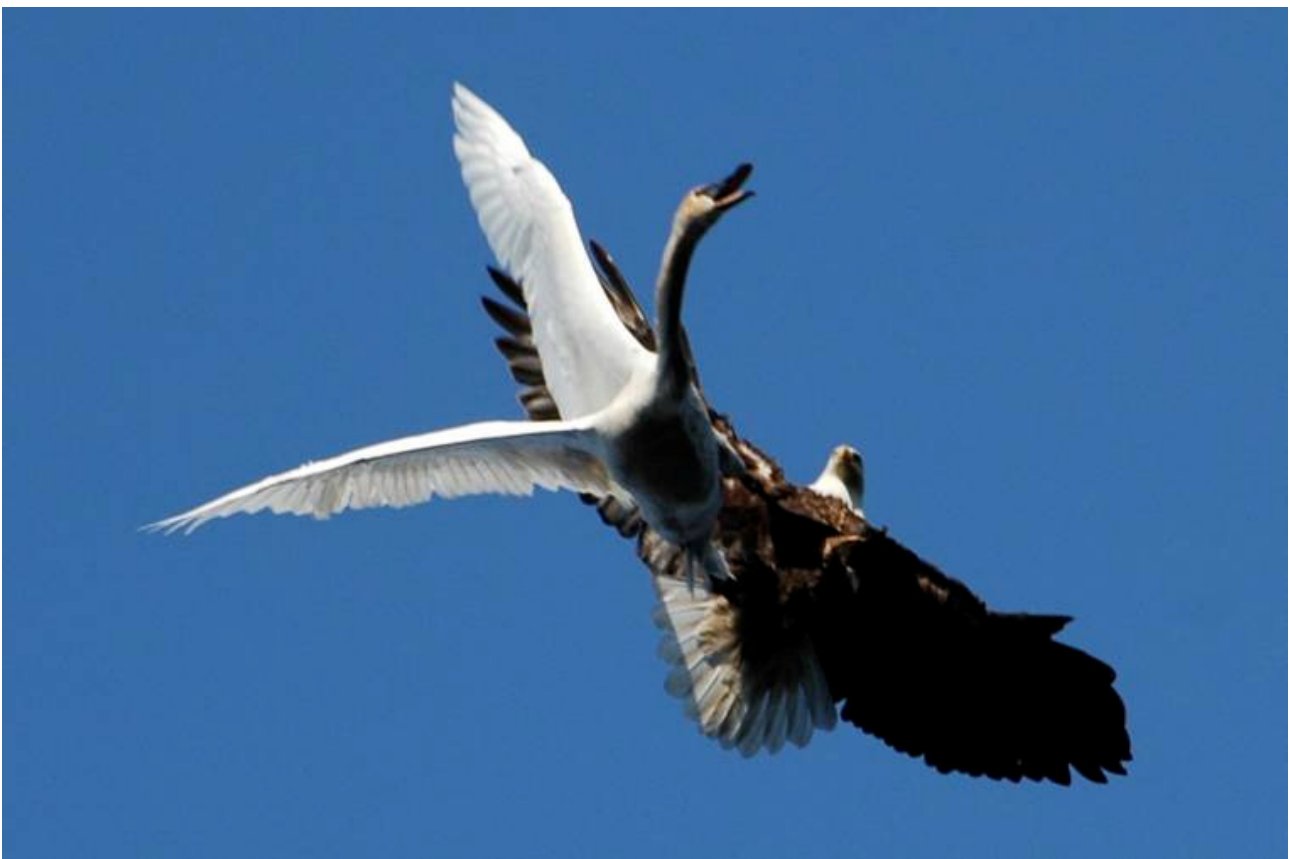
The poor swan must be scared to death ... It is attempting to actually escape death in the air