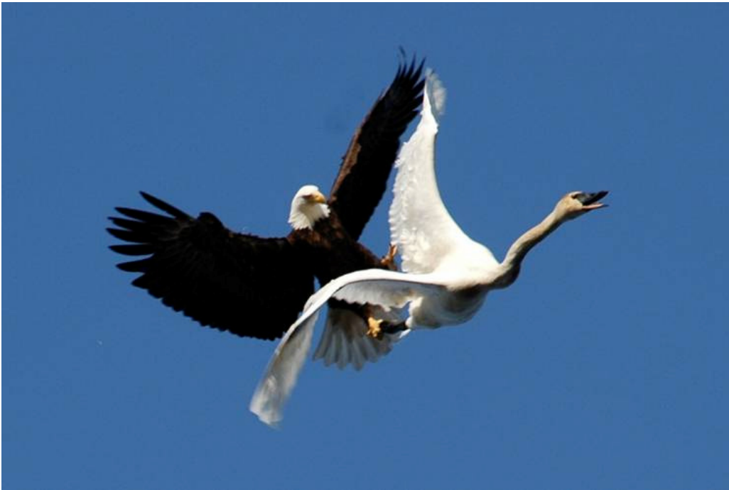
This one is so amazing to see the actual eagle wing span beside the swan.