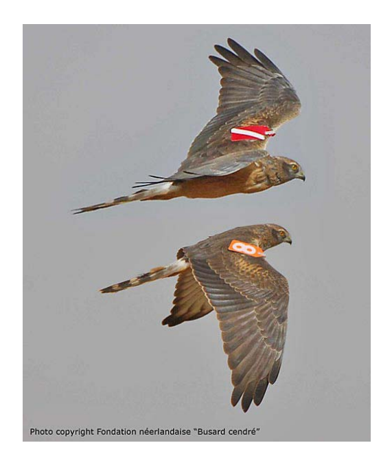
Fig. 3: A young male Montagu's Harrier whose wingtags were read in Senegal.

For the Dutch population holds that the wingtags of several young have been read during their premigration, and one Dutch female young has been read on her migration through France. A Dutch team travelling in W-Africa on a Harrier mission could read several wingtags, one of which a young male from France (fig. 3).