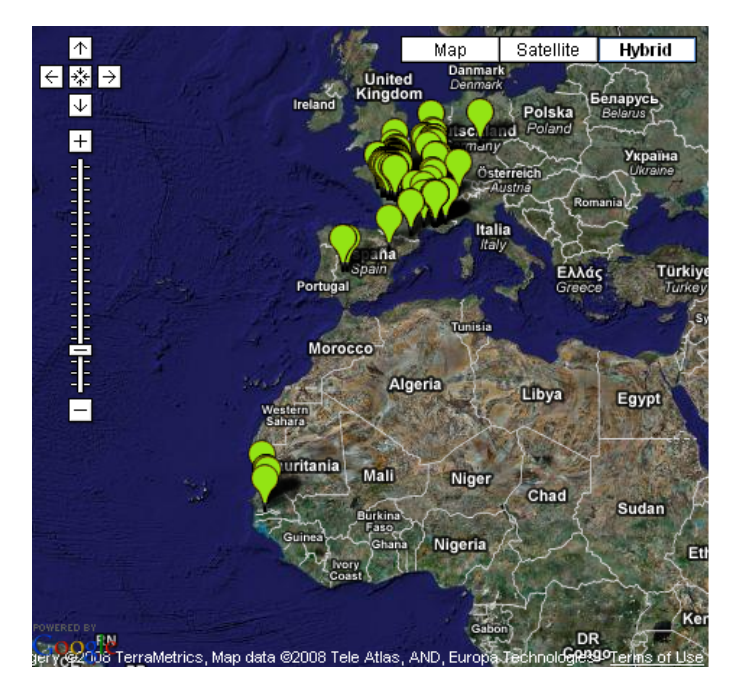
Fig. 2: Wingtag readings from www.busards.com. Copyright is with www.busards.com