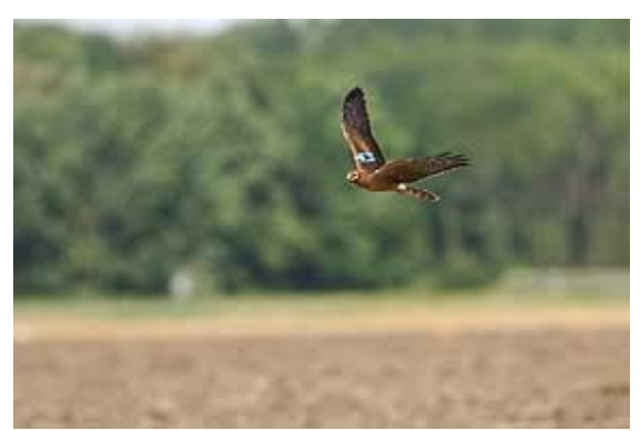
Colour-ringed (left) and wingtagged (right) Montagu's Harrier in the Netherlands.

We think that nature protection goes hand in hand with proper data collection. We were convinced for the use of wingtags by the high proportion of readings of wingtags, which is not only caused by the good visibility of the tags, but also by the extra effort of observers in Europe and Africa to read as many tags as possible, from now on and at least for the next four years. After the project period, we will use colour-rings again. Next to the high reading rate of wingtags, the excellent organisation, clear scientific question and conservation relevance of the French project has convinced us. Besides that, the material (tags) provided is of good quality.